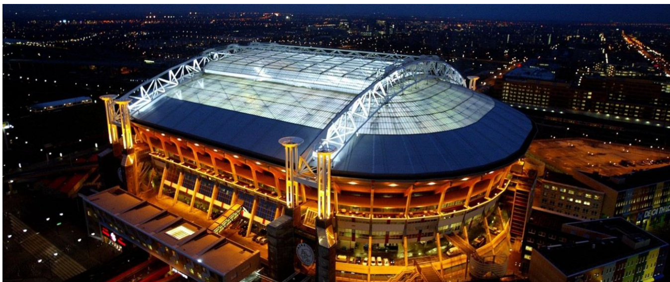
Johan Cruyff Arena, the Netherlands, LEXAN™ THERMOCLEAR™ Sheet has been in use since 1995, now 28 years!